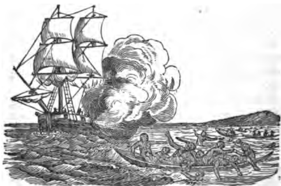
The Sea Otter firing upon the Natives.

That soon after Captain Hanna, of the Sea-Otter , in consequence of one of the natives having stolen a chisel from the carpenter, fired upon their canoes which were along side, and killed upwards of twenty of the natives, of whom several were Tyees or chiefs, and that he himself being on board the vessel, in order to escape was obliged to leap from the quarter deck, and swim for a long way under water.